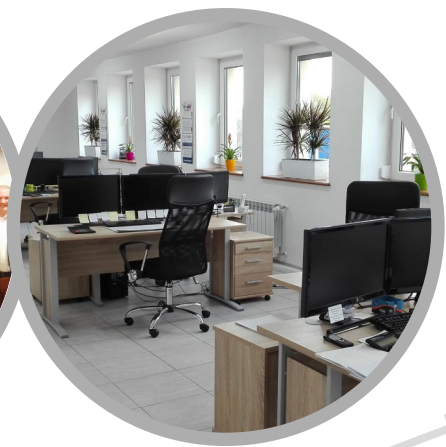
We move to the current office. The company employs 17 people who coordinate the work of 42 drives throughout the UE.