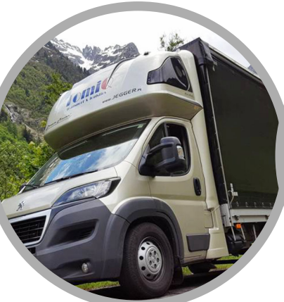
The tuck with TomiQ logo goes through the countries with our first delivery.