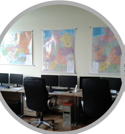
Tomek employs new workers. The current office seems to be too small. They move to the new one in the center of Pabianice.